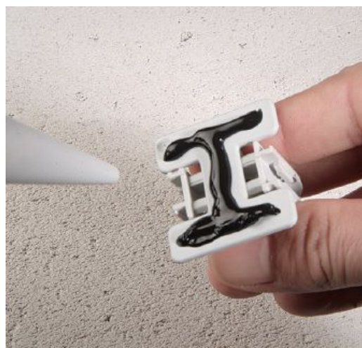
The EC Euro clip can be mounted on plasterboard with the aid of the EKP Euro adhesive pad.