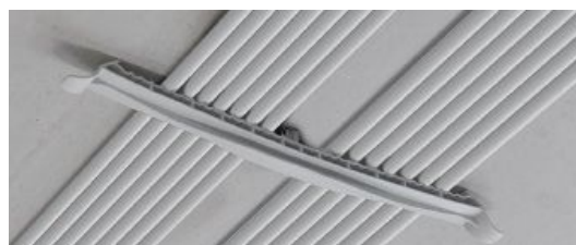
The KB cable brackets have been developed for the section installation of wiring harnesses.

Schnabl Stecktechnik GmbH Bahnhofplatz 1, Postfach 63, 3100 St. Pölten, Austria Telefon +43(0)2742/22167-0, Telefax +43(0)2742/22167-50 office@schnabl.works, www.schnabl.works