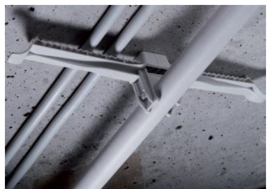
An additional EC Euro-Clip for Pipe installation can be mounted at the center of the KBS.

Schnabl Stecktechnik GmbH Bahnhofplatz 1, Postfach 63, 3100 St. Pölten, Austria Telefon +43(0)2742/22167-0, Telefax +43(0)2742/22167-50 office@schnabl.works, www.schnabl.works