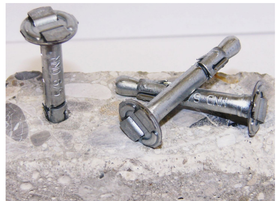
The MND 6 Dowel Nail expands, no need to hold the fixing! 15 % time saving for overhead work.