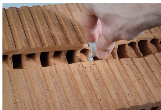
Simply brilliant: the integrated nib on the interior side of the clip enables the pipe to tense between the two clips for easier cable insertion.

Schnabl Stecktechnik GmbH Bahnhofplatz 1, Postfach 63, 3100 St. Pölten, Austria Telefon +43(0)2742/22167-0, Telefax +43(0)2742/22167-50 office@schnabl.works, www.schnabl.works